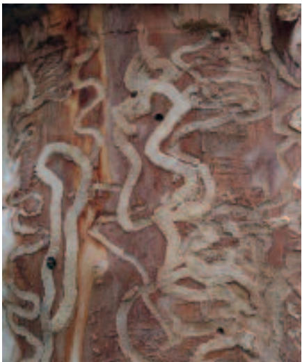
Feeding tunnels.

EAB lays eggs in cracks and crevices of the bark of ash trees and other species growing near them. Its larvae hatch and chew into ash bark, creating serpentine feeding tunnels that prohibit a tree from distributing nourishment throughout its trunk and branches. As adults, the beetles chew their way out, leaving D-shaped exit holes in bark, and move on to continue the life cycle of this invasive pest. Despite ongoing research into prevention and treatment, the devastation continues.