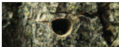
Adult emerald ash borers and an exit hole on an ash tree.

Agrilus planipennis , commonly known as the emerald ash borer, or EAB, takes its name from the combination of its distinctive coloration, the trees on which it feeds, and the way it damages them. It poses little threat to vegetation in its native habitat, where some ash trees show genetic resistance to it. In fact, until EAB invaded North America, this green jewel beetle excited little attention in the parts of Russia, China, Japan, and Korea in which it originates. The earliest western reports of it date to the late 19th century. In the 1870s, a French naturalist sent home an EAB specimen from a trip to China. A French entomologist published a brief description of the beetle in 1888.